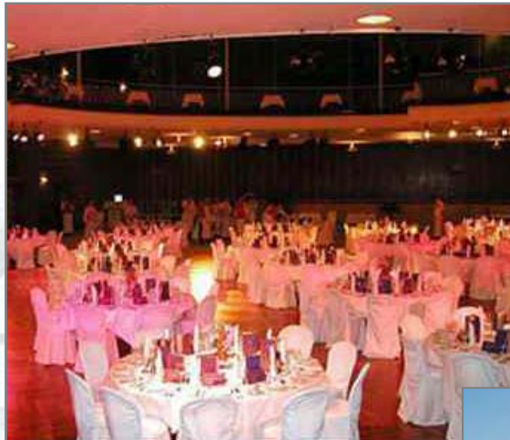
Palais am Funkturm

Get-together: organizational and catering services provided by Capital Catering GmbH.