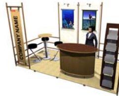
Example: Row stand