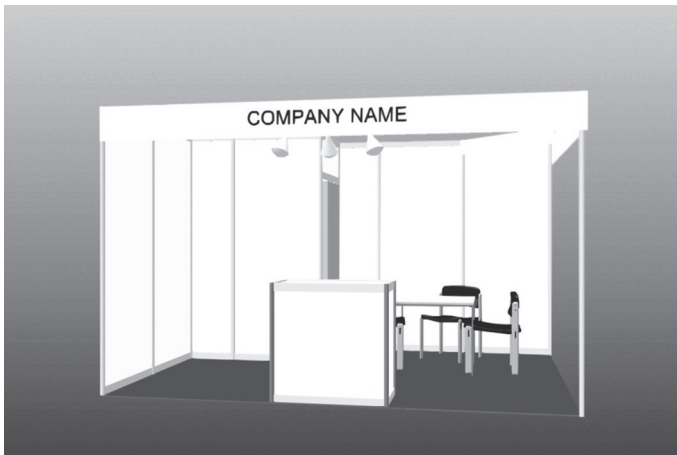
12 - 20 m 2 complete-stand