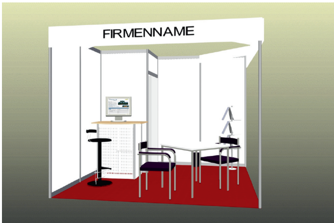
9 m² complete arrangement price row stand: € 2,650 (plus VAT)