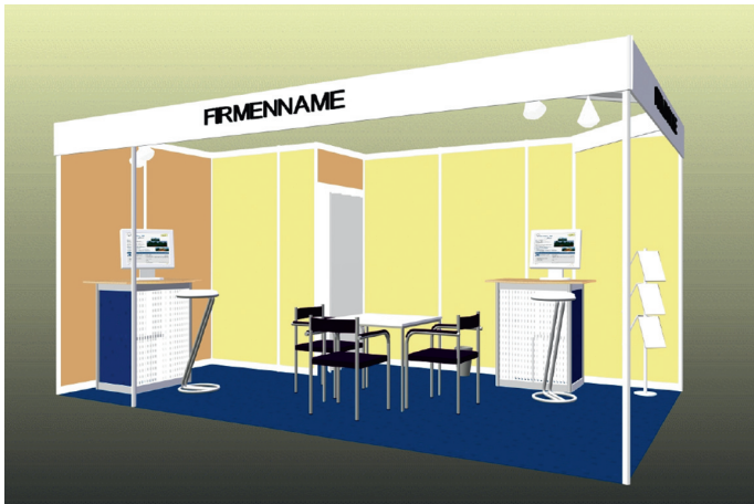
15 m² complete arrangement price row stand: € 4,350 (plus VAT)